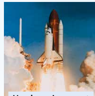
Harsh environment labels