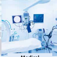
Medical laboratory labels