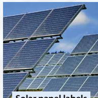
Solar panel labels